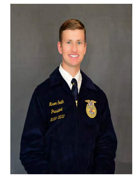
"In the same way, let your light shine before others, so that they may see your good works and give glory to your Father who is in heaven" - Matthew 5:16

"Before you are a leader, success is all about growing yourself. When you become a leader, success is all about growing others." My time in the FFA is basically split into two halves; the time I knew that I could simply make an impact and then when I discovered the impact that FFA members had on me. During a leadership conference towards the end of my sophomore year, I realized the capabilities of a leader would expound if we shifted the focus from what we can do as individuals to what is possible as a whole. From that point on, I devoted myself to serving as a mentor in my chapter by taking every opportunity to grow others through the things I'm passionate about: livestock, speaking, and my love for Christ. As servant leaders in this organization, it's imperative that we each discover our passions and use them to serve our friends, teachers, and communities, ultimately being the positive influence that we want to see in our world today.