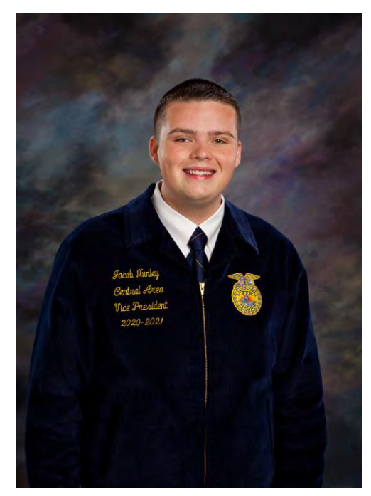
"Time is free, but it's priceless." -Harvey Mackay

We all value time. Whether it be the extra five minutes you were let out early for lunch, or even the times spent laughing with our friends, we all value time. Sometimes it seems like we have so little time to spare, while some days, we never have enough to fill the time. However, FFA members, this past year I have spent my time with you all. You see, we may think we have all the time in the world to step out of our comfort zone, meet new people, or even try something new, but it's when we don't use that time, that we miss out on life-changing opportunities. FFA members, the time I have spent serving you has been priceless. From chapter visits across the state, or even crying at Alumni Camp as I wrote my final happy gram, I have valued every second I have been given to serve this organization. As my time grows on, I have cherished the small moments serving members which have made the largest impact on this world. Oklahoma FFA, I humbly ask that you allow me to serve you as your State FFA President and use our time to grow each other.